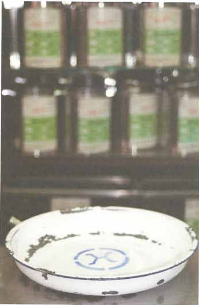
INSIDE A TEASHOP

This district has a rich past of traditional crafts, which is still visible for the observant eye. Meanwhile, our 21st century is knocking at the door, embodied by events like Beijing Design Week. This will surely lead to exciting pollination between traditional craftsmanship and contemporary design.